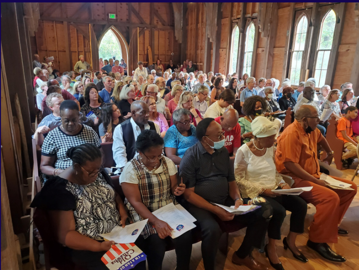
People gather inside St. Luke's Church for HymnFest

Old Cahawba Archaeological Park lies at the confluence of the Alabama and Cahaba Rivers. From 1819 to 1826, it served as Alabama's first capital. Old Cahawba is a historic property of the Alabama Historical Commission. To learn more, call 334-872-8058 or visit Old Cahawba here .